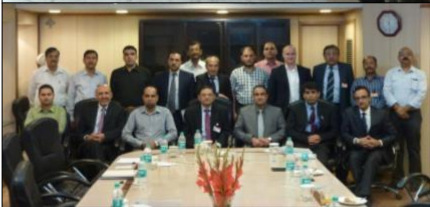
DABS & MEW delegates met with the Solar Energy Corporation of India (SECI) and NTPC Vidyut Vyapur Nigam Ltd (NVVN) to learn about their experiences in facilitating reverse auctions for solar power, and the key challenges and opportunities encountered along the way.

Following the meeting with NVVN, the delegation met with the Solar Energy Corporation of India (SECI), an organization under MNRE with the mandate of developing, deploying and promoting solar power across India. SECI also implements the solar reverse auction under Phase-2 of the National Solar Mission, by signing PPA's with credible developers and back-to-back Power Supply Agreements (PSA's) with interested distribution companies. The delegation from Afghanistan was interested in reviewing SECI's technical requirements for projects, which included, among others, only using commercially established technology, solar cells and modules sourced only from India for up to 375 MW of commissioned projects, a minimum project capacity of 10 MW and max of 50 MW, no more than 5 separate project bids by developers (cumulative capacity of 100 MW), an interconnection with the