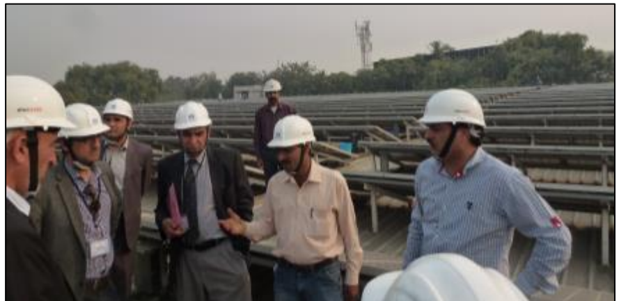
Delegates had the opportunity to tour TATA Power Delhi Distribution Ltd.’s CENSTORE 1 MW rooftop solar installation, which sits atop the distribution utility’s district equipment warehouse.

Currently, Afghanistan does not possess any grid-scale renewable energy assets. While gifted with solar and wind resource potential, the country relies primarily on power imports, followed by hydro and thermal plants, and finally diesel generation. Da Afghanistan Breshna Sherkat (DABS) is the state-owned provider of electrical power in Afghanistan. Of the estimated 5 million MWh of electricity consumed in Afghanistan in 2013, 78% was imported from neighboring countries and 19% was generated in Afghanistan with hydroelectric sources. Given this supply scenario, Afghanistan is currently embarking on ways to attract clean energy developers and interested renewable Independent Power Producers (IPPs). At the time of the executive exchange to India, DABS was exploring options to establish Afghanistan’s first ever solar reverse auction, with the goal of bringing online between 5-10 MW of grid-connected solar power, slated for the province of Kandahar.