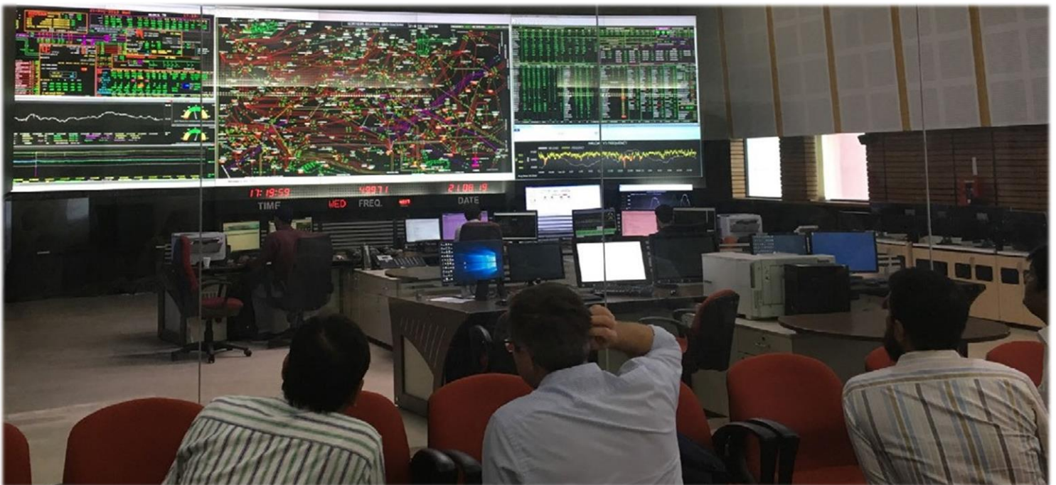
Site visit to POSOCO's Northern Regional Load Despatch Centre in New Delhi, India

The workshop also included a site visit to Power System Operation Corporation Limited's (POSOCO) Northern Regional Load Despatch Centre in New Delhi. This site visit allowed the participants to learn more about POSOCO's role in system operation and their plan to increase Automatic Generation Control (AGC) throughout their generation fleet to reduce the overall system costs. After the workshop, a survey revealed most of the participants (85%) considered "economic interchange" as the main driver for a synchronous connection, and 57% believe that the Bangladesh, Bhutan, India, Nepal subregion will become completely synchronous in "10 years or less". This synchronization will decrease energy costs in addition to increasing cross-border energy trade and competition.