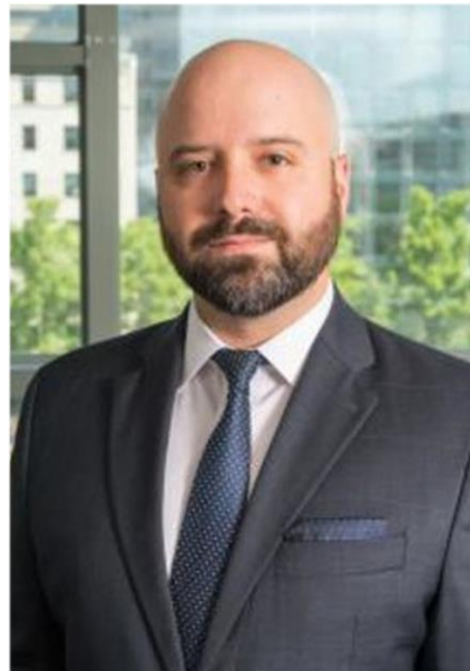
Program Director, EAGP