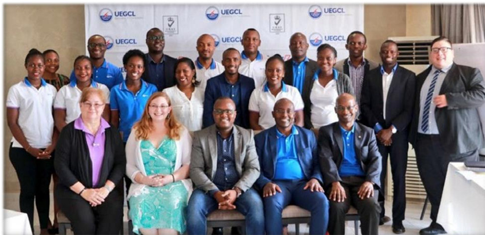
Group photo of Asset Management Certification Training in Kampala, Uganda

plan and forecast budgets for the different assets to ensure profitability and financial growth throughout the life cycle of assets. By supporting Uganda's journey to self-reliance, UEGCL can now recognize and manage the risks involved in asset failures and therefore define level of service across the different assets and set up systems to monitor performance to ensure sustainable use of physical resources.