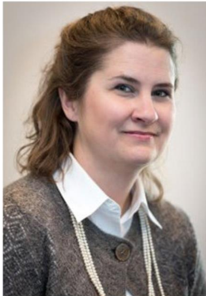
Deputy Program Director, EUPP