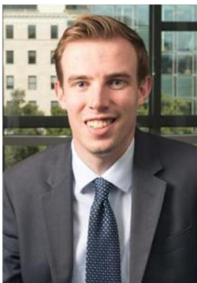
Program Coordinator, EUPP