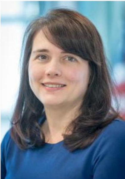
Deputy Program Director, EUPP