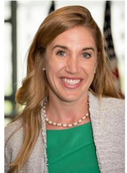
Deputy Program Director, EAGP