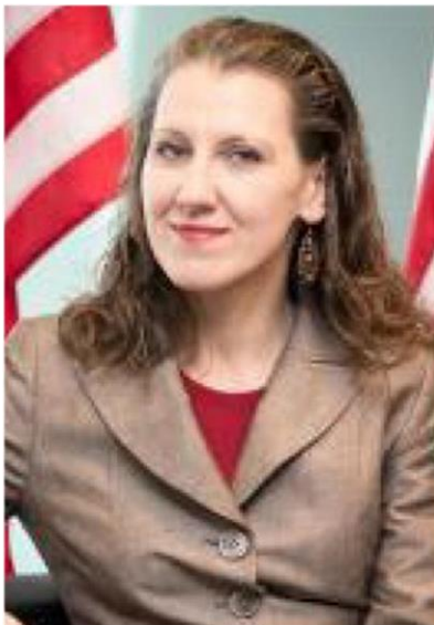
Senior Program Coordinator, EUPP