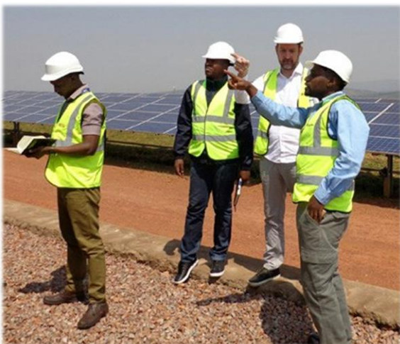
Site visit to Rwamagana Solar Plant to perform analyses of the existing system operation procedures

Additionally, EUPP supported an analysis of the existing system operation procedures in REG's subsidiary, the Energy Utility Corporation Limited (EUCL), for voltage and frequency controls. This analysis, along with system enhancement suggestions, will allow EUCL to optimize and efficiently control system frequency. This extended project has further enhanced EUCL's capacity for integrating renewable energy power plants and expanded capacity for network modeling and analysis.