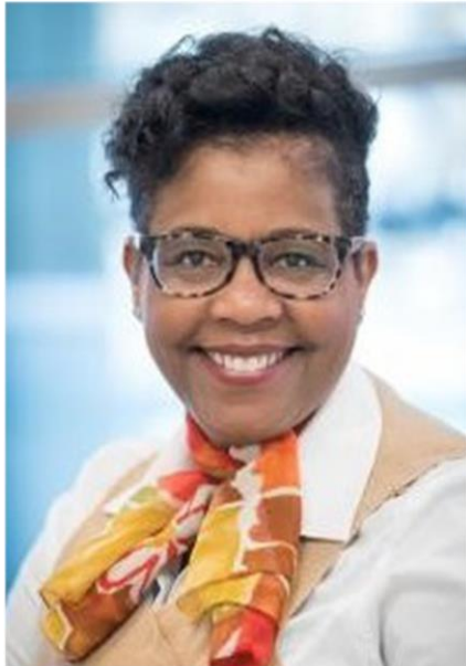
Program Director, EUPP