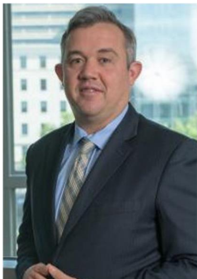
Senior Program Coordinator, EAGP