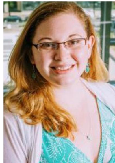
Senior Program Coordinator, EUPP