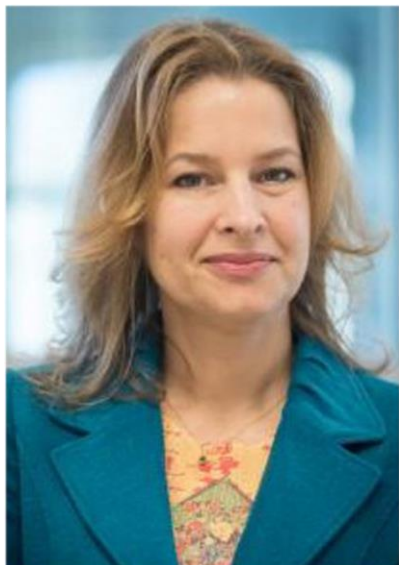
Senior Program Coordinator, EUPP