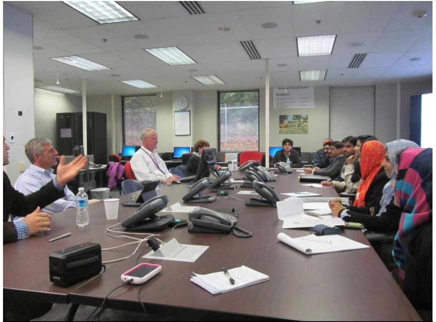
The delegation met with PEPCO executives (left) on SCADA and EMS systems.

PEPCO executives outlined their Emergency Management System (EMS) and Supervisory Control and Data Acquisition (SCADA) applications and how they interact and work together. PEPCO uses the EMS to run contingencies and models to determine if they can shut down equipment for maintenance. The delegation questioned whether EMS only works if you have SCADA at all substations. PEPCO said SCADA is not needed at all substations – instead, a state estimator can fill the holes in data. PEPCO uses the EMS applications to also control radial load bus voltage by controlling transformer LTCs to maintain adequate substation voltage and uses a distribution VAR dispatch program to maintain adequate power factor by controlling distribution capacitors. The delegation asked a lot of questions about power factor. PEPCO also relies on static VAR compensators to regulate voltage, power factor and harmonics to stabilize the system.