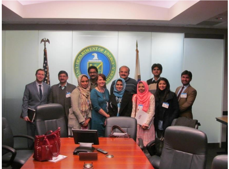
Pakistan delegation at the U.S. Department of Energy in Washington, DC.

A key topic discussed by PGE was voltage stability studies. PGE stated that Q-V curves (reactive power injection and receiving end voltage) are the most useful planning tool to determine reactive requirements as they give you good idea if you have a voltage collapse problem. Q-V curves give the reactive mvar margin at bus, where reactive could be added, and can determine capacitor sizing, and the critical voltage where a bus voltage collapse occurs. However, the Q-V curves do not tell you how far from the voltage collapse point you are so you should use P-V (transmitted power and receiving end voltage) and Q-V together.