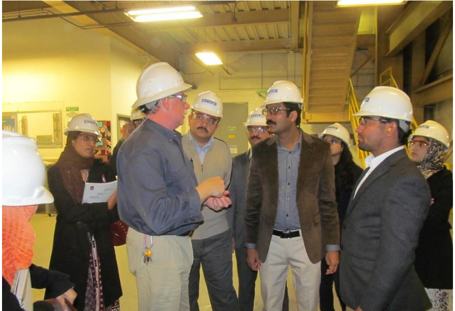
The delegation toured the Alexandria, Virginia municipal-waste-to-energy Covanta Energy power facility . The facility's three, 325 ton-per-day furnaces process 975 tons of solid waste, generating up to 23 MWs of