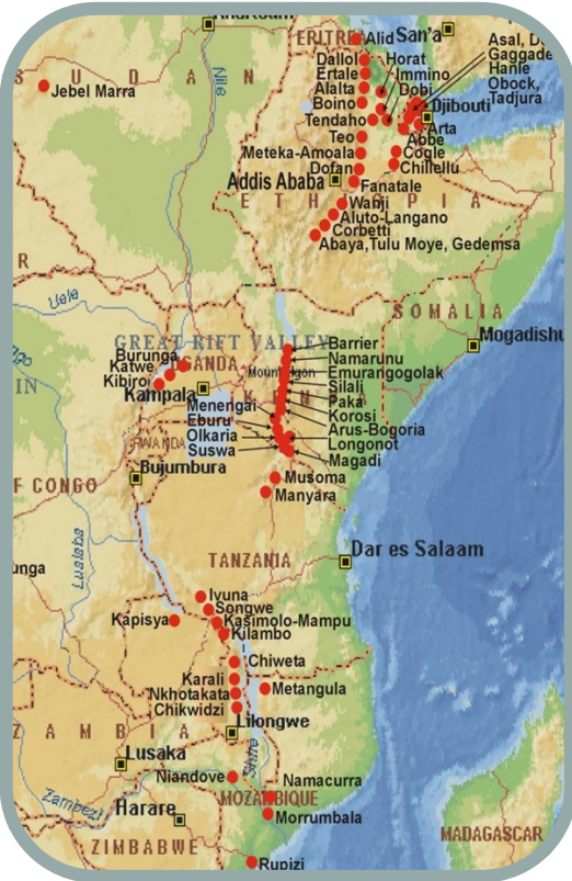
Geothermal prospect areas in East Africa's Rift Valley region.