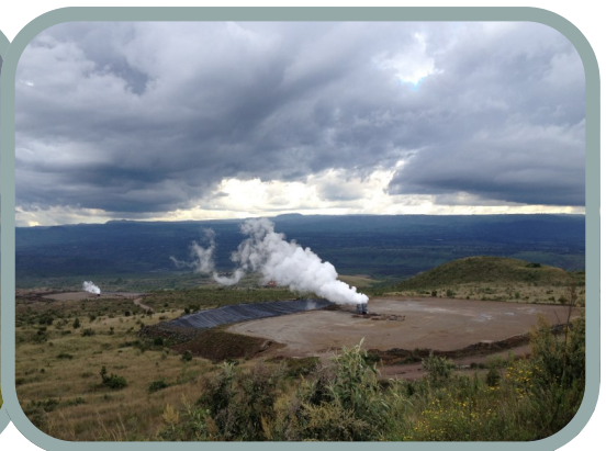
EAGP Capacity Building Program at Menengai Geothermal Field, Kenya.