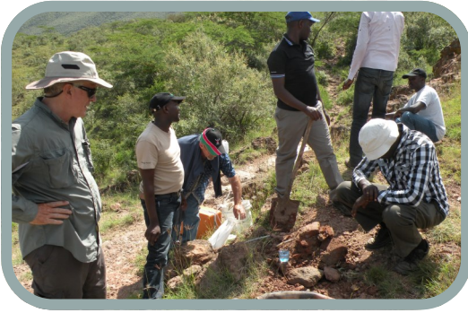
EAGP Capacity Building Program at Suswa Geothermal Prospect, Kenya.