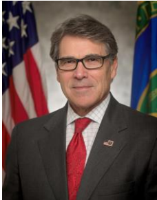
RICK PERRY Secretary United States Department of Energy