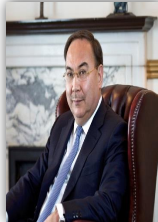
HIS EXCELLENCY ERZHAN KAZYKHANOV

Vice Chairman – House Committee on Energy and Commerce