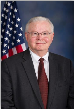
CONGRESSMAN JOE BARTON

Vice Chairman – House Committee on Energy and Commerce