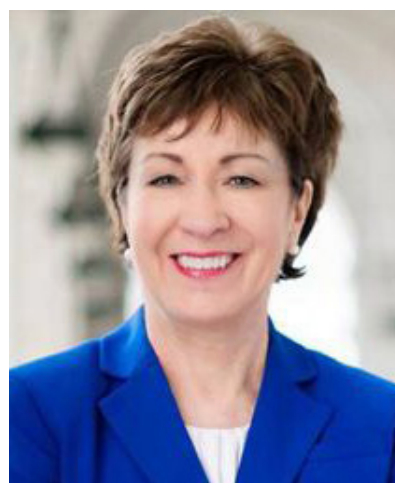
Senator Susan Collins Maine