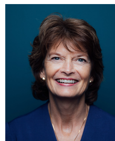
Senator Lisa Murkowski Alaska