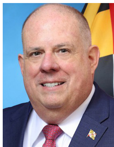
Governor Larry Hogan Maryland