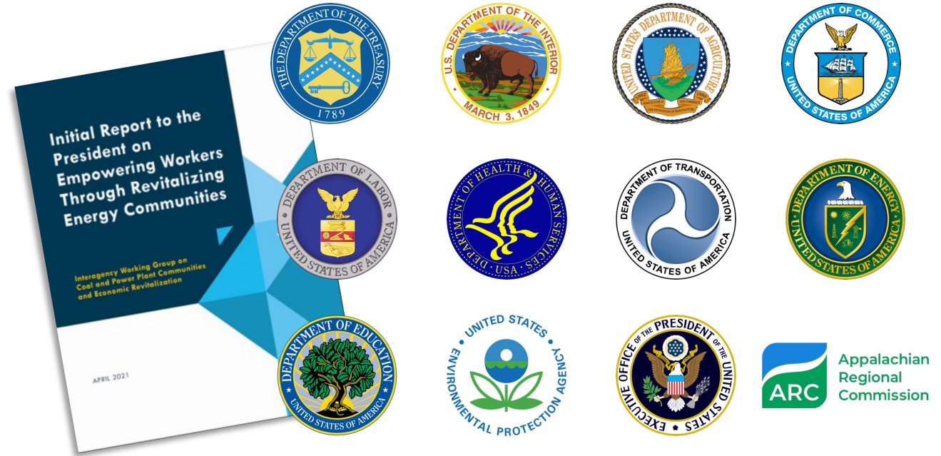
Initial Report to the President on Empowering Workers Through Revitalizing Energy Communities, Released April 23, 2021