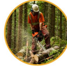
Storm & Wildfire Mitigation & Response