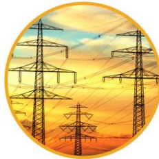
Smarter Energy Infrastructure