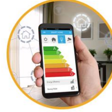
Innovative Customer Solutions