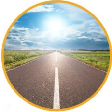
ESG & Natural Gas Sustainability