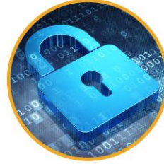
Grid Security & Resilience