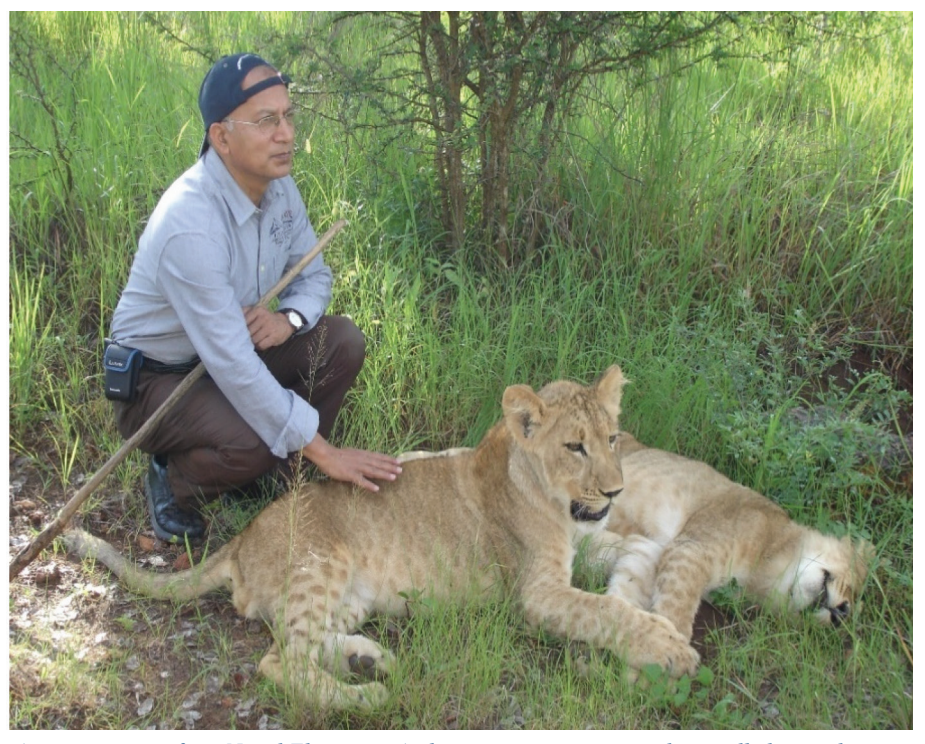
A representative from Nepal Electricity Authority participating in a lion walk during their attendance at the SAPP Meetings held at Victoria Falls