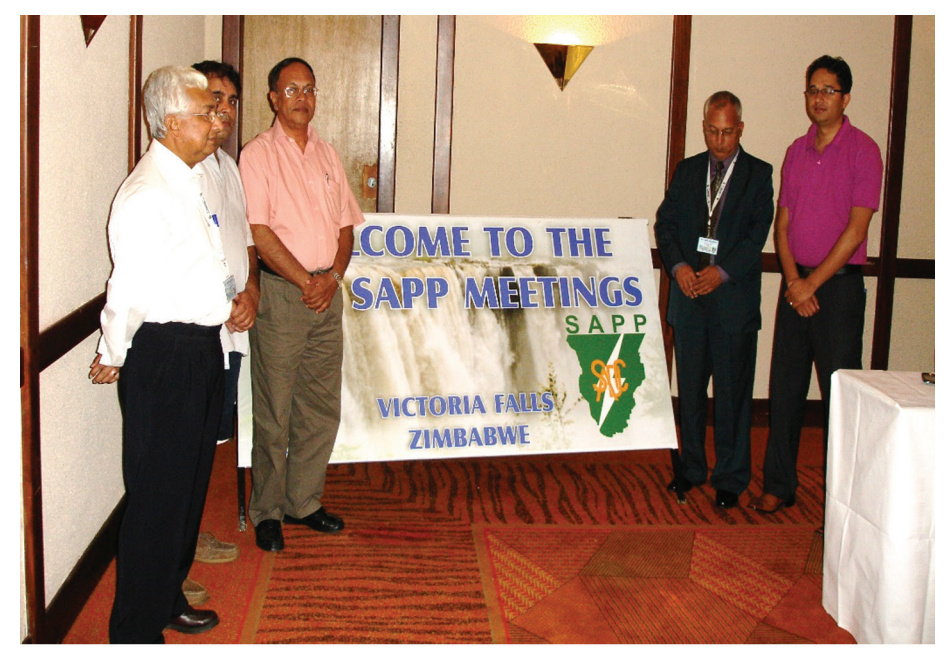
Members of the South Asia Regional Initiative for Energy Integration attending a regional Southern African Power Pool annual meeting to discuss power market issues.