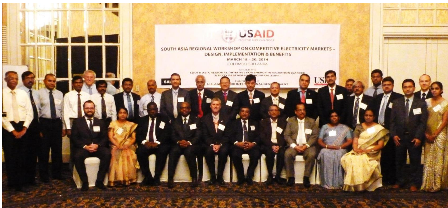
Above: Participants in the South Asia Regional Workshop on Competitive Electricity Markets in Colombo, Sri Lanka

COLOMBO, SRI LANKA - The United States Energy Association, under the South Asia Regional Initiative for Energy Integration (SARI/EI), with funding from the United States Agency for International Development, organized a South Asia Regional Workshop on Competitive Electricity Markets that took place March 18 – 20, 2014 in Colombo, Sri Lanka. The first two days of the workshop included technical presentations by power pool experts, updates on cross-border electricity trade (CBET) from each of the participating countries, and open discussions on the development of a regional grid and electricity market in South Asia. On the final day of the workshop, participants visited generating stations in the Puttalam area.