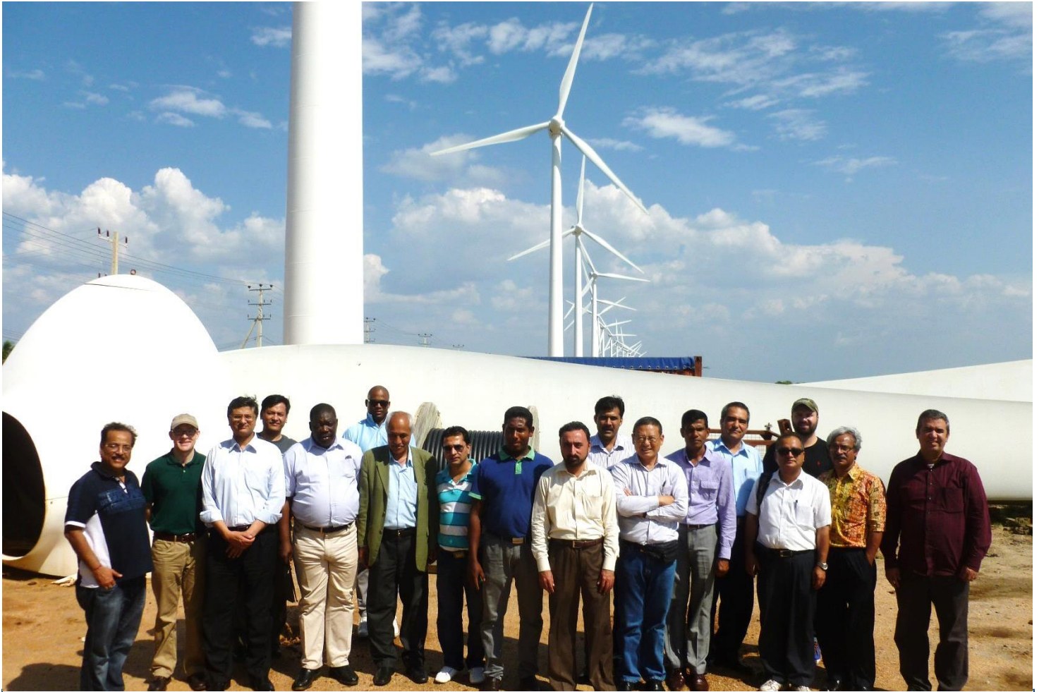
Above: Participants visit the 20 MW wind farm in Puttalam operated by WindForce, Ltd.

On the final day of the workshop, participants travelled to Puttalam to visit the 20 MW Puttalam wind farm. The Puttalam wind farm is a combination of two 10MW facilities that are owned and operated by WindForce Ltd., an independent power producer. Participants were interested to learn more about how wind power was integrated into CEB’s electric grid. Under a standard national PPA for wind electricity, CEB purchases all energy produced by the facility. In 2013, the total energy delivered by the wind farm was 30,023,736 kWh.