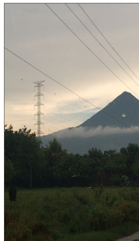
Far left: 230 kv transmission lines connecting El Salvador to the SIEPAC network.