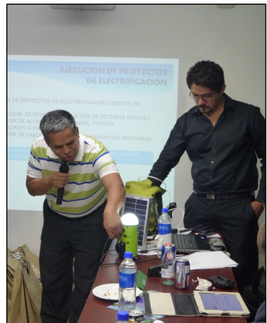
Delegates learn about the Salvadoran National Energy Council’s rural electrification projects during a hands-on presentation.

This second HEPP executive exchange exposed senior executives from Haiti’s energy sector to numerous best practices in electricity sector reform and governance. Delegates related to El Salvador’s experience of suffering the financial repercussions from a lack of adequate investment in the power sector, as well as the challenge of normalizing large numbers of utility customers who are unaccustomed to paying for their power, or who unable to because of their remote location.