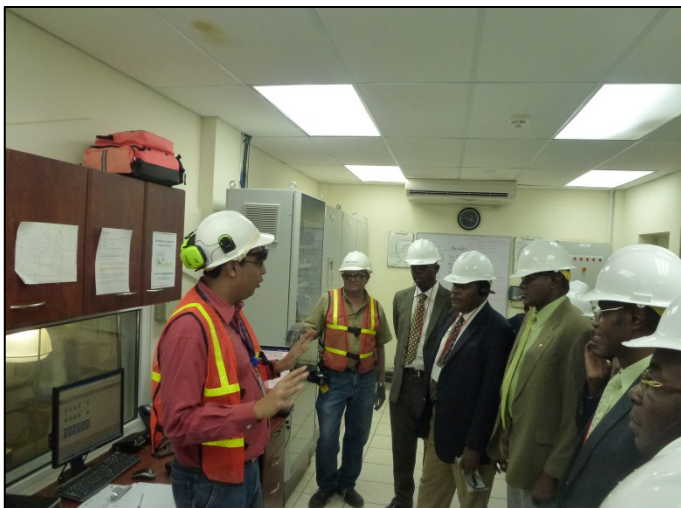
Delegates receive a brief presentation by Nejapa plant operators during their tour of the methane recovery facility.

Comisión Regional de Inteconexión Eléctrica (CRIE), the body responsible for setting tariffs and regulating trade. With financial backing from the International Development Bank, Central America Bank for Economic Integration and the Spanish Government, the project moved toward implementation.