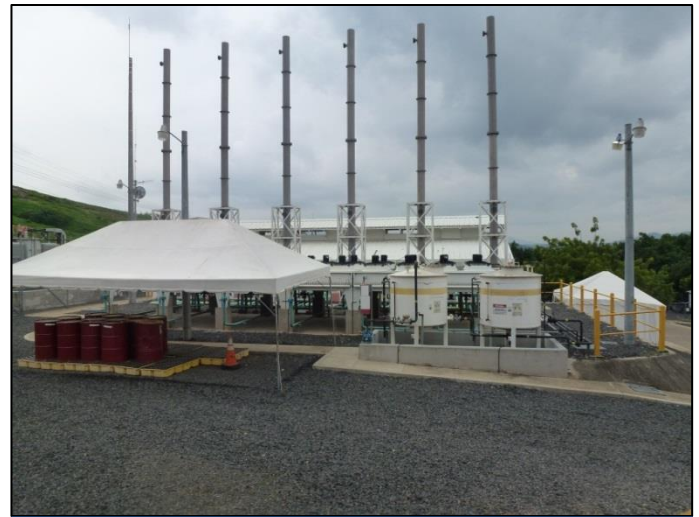
AES hosted the delegation for a tour of their 6 MW Nejapa Landfill Gas to Energy Plant.